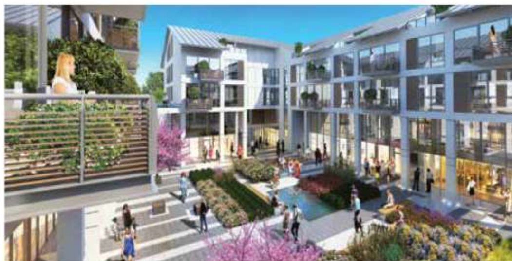
LIVE &amp; WORK