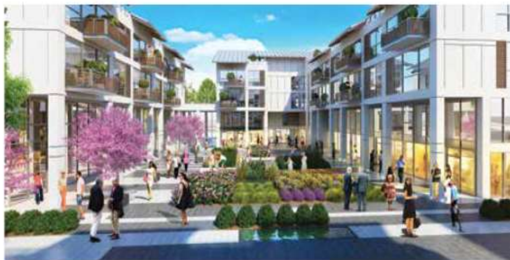
LIVE &amp; WORK